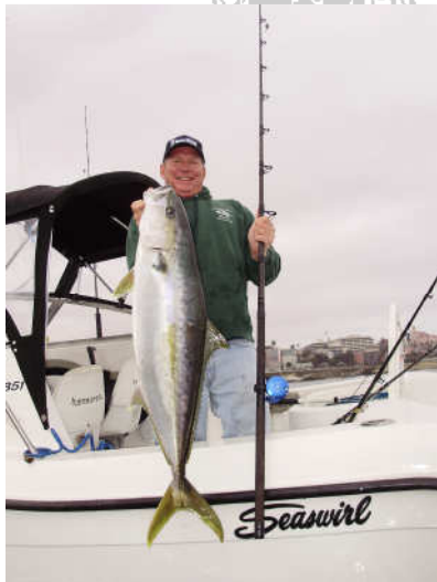
This yellow was 31.4 bled out off LJ on Squid